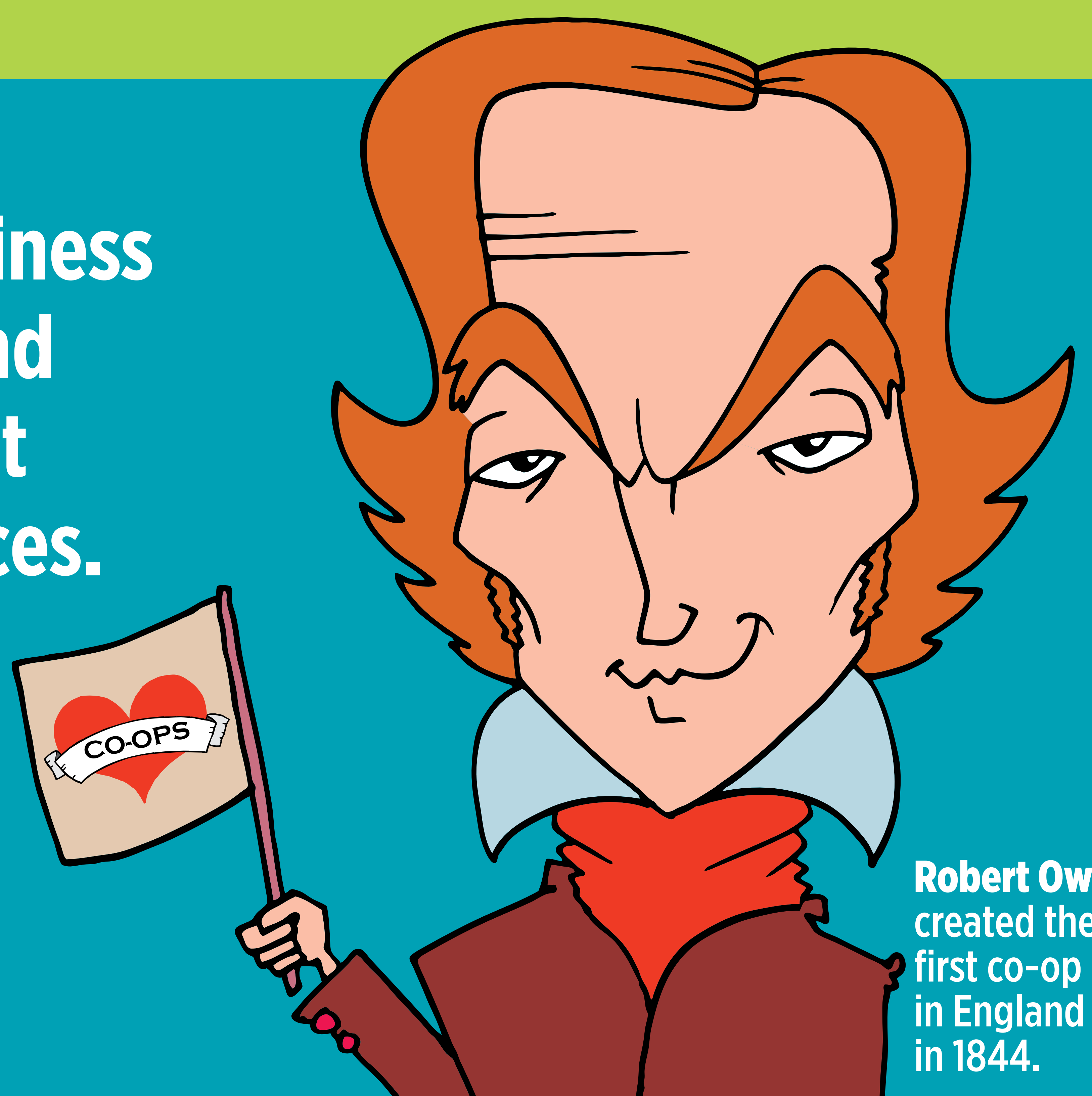
Robert Owen created the first co-op in England in 1844.

A co-operative is a business enterprise owned by and operated for the benefit of those using its services. Twice as many co-ops remain in business after 10 years as other business enterprises.